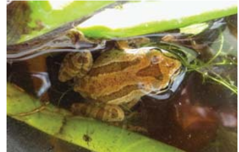
Eager to check out his newly-renovated home

Recently problems had developed. There was little swimming room for the mosquito fish to eat larvae or for frogs and toads to spawn, and this year someone