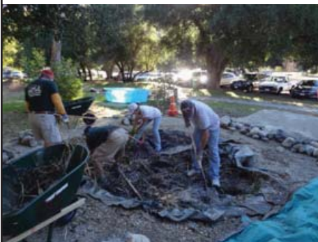
Digging up the old pond, roots and all

The rest is up to Mother Nature and we cannot rush her.