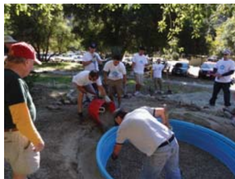
Getting the sand into the pond and sides