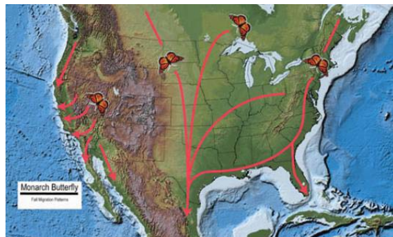
Schematic map of the fall migration pathways

We can often find tens of thousands of Monarch butterflies in eucalyptus groves along the Pacific Coast, one of the closest to Placerita being only a 2 hour drive away in Goleta, CA (Monarch Preserve) along SR 101. Go to www.goleta.com to get more details. The eucalyptus trees are flowering in December and January (perhaps because that is summer in their native home of Australia) thus providing a nectar source for the Monarchs on the warmer days. But Eucalyptus trees are immigrants themselves so where did the Monarchs go previously as migration is not a new phenomenon? Even the colder days do not involve snow and ice allowing the Monarchs to survive winter on the Pacific Coast that would not be possible in the Rockies.