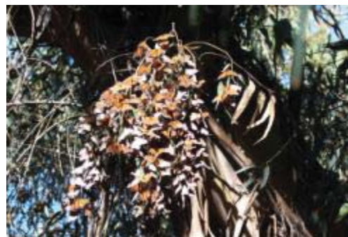
A mass of Monarch butterflies in the Eucalyptus Grove in the Monarch Preserve in Goleta, CA

There is another group of butterflies, one that most people do not think about nor generally appreciate. This is the Vanessa family, the most famous being the Painted Lady ( Vanessa cardui ) and a close relative, the Red Admiral ( Vanessa atalanta ). This