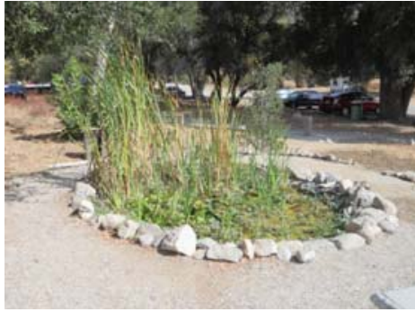
The finished product. Just beautiful!