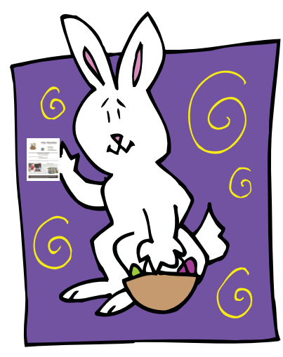
The Easter Bunny took the Rattler on his rounds.